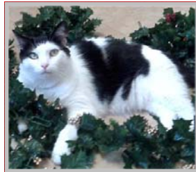
Bingo Helps Decorate

We love every dog and cat who becomes a PAWS animal. But cats and dogs who take a bit longer to find their forever homes steal our hearts. We see them at their best. So we are saddened by how long it takes them to find their matches. Still we know that some simply don't show well during open hours.