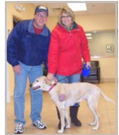
Lacey & Her People

Lacey was reunited with her family in the PAWS lobby. She recognized her people right away. While her foster told her people how wonderful she'd been, Lacey stood by the door, waiting to go