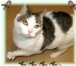
A festive Sweetcake