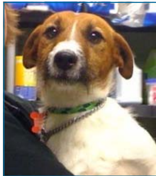
Steeler, a big football fan

Thank you for your continued support of PAWS and the animals we care for.