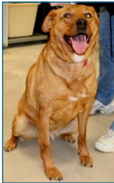
Lady ready to snuggle

Lady will steal your heart with just one look. Visitors to PAWS exclaim, "What a beautiful girl!" when they see her. She has a stunning red coat, gorgeous amber eyes and a hint of a white stripe down her nose.