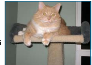
Bailey resting after his long flight