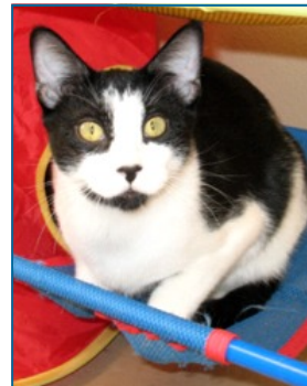
Heinlein, one of the KitTEENS