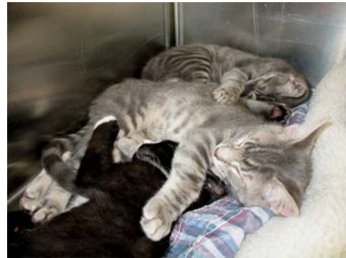
We wish we had a foster home—it sure is boring living at the shelter!

If you are interested in fostering a dog or cat, please stop by the PAWS shelter weekends between 11 and 4 and pick up an application.