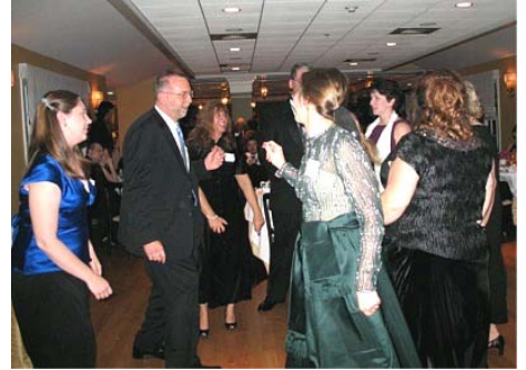
PAWS board members and volunteers show off their dancing skill at last years Fur Ball.

If you are interested in attending or sponsoring the Fur Ball please contact Linette Courtney at lxc2@psu.edu . Tickets are $125 each.