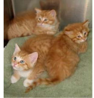
We'll see YOU on September 16!