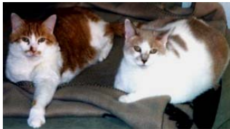
Lillian (l) and Simon (r) relax at home

Lillian & Ginger: The “shy sisters” were found taped inside a box outside the PAWS center one cold November morning. Terrified and cowering in their cage, overlooked by potential adopters looking for more friendly and fearless cats, these girls overcame so much. It took them a long time to muster up the courage to explore the center but once they got over their fear, there was no stopping them. They blossomed into lovely, affectionate cats. Everyone who worked at the center while they were there had a special place in their hearts for them. Both have been adopted by wonderful families. Ginger now shares her home with former PAWS cat and founder of the Lonely Hearts Club, Ebony (see below) and Lillian now lives with former PAWS cat Simon.