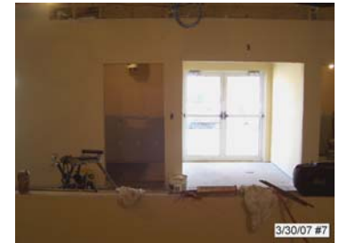
Main entrance and lobby