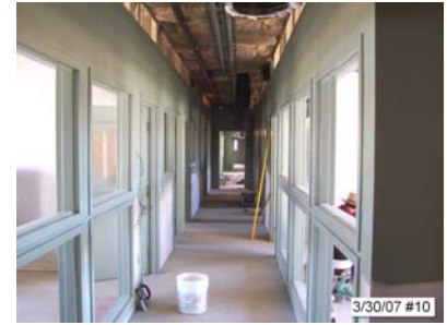
The main hall of the cat wing