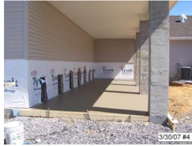
Outside view of the dog kennels

Follow the progress of the building at www.centercountypaws.org