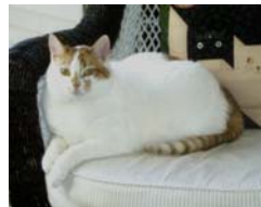
Ginger sunning her- self on the porch