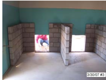
Inside view of the dog kennels