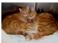
Tulley &amp; Finnegan