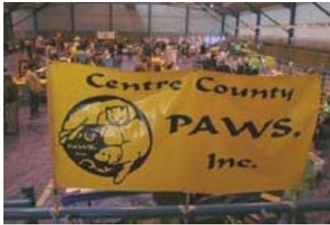
The 2005 Pet Extravaganza raised over $12,000 for PAWS. We hope to raise even more this year!

PAWS cats and dogs currently available for adoption will also be